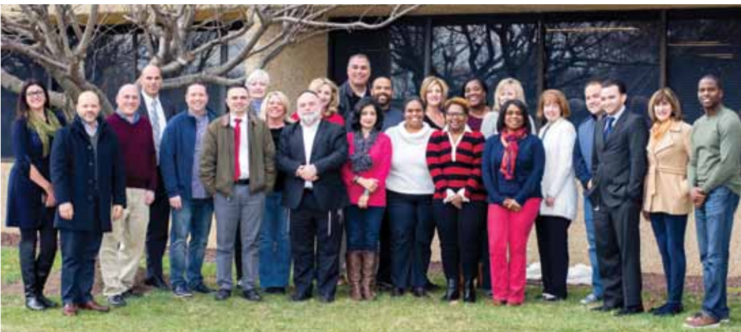
NJASFAA Executive Council Members

HESAA is heavily engaged in the New Jersey Association of Student Financial Aid Administrators (NJASFAA). NJASFAA members consist of student financial aid professionals employed at the various colleges and universities throughout the State. Its mission is to promote sound financial aid policies and practices. Below is a picture of the NJASFAA Executive Council following a meeting at the Authority.